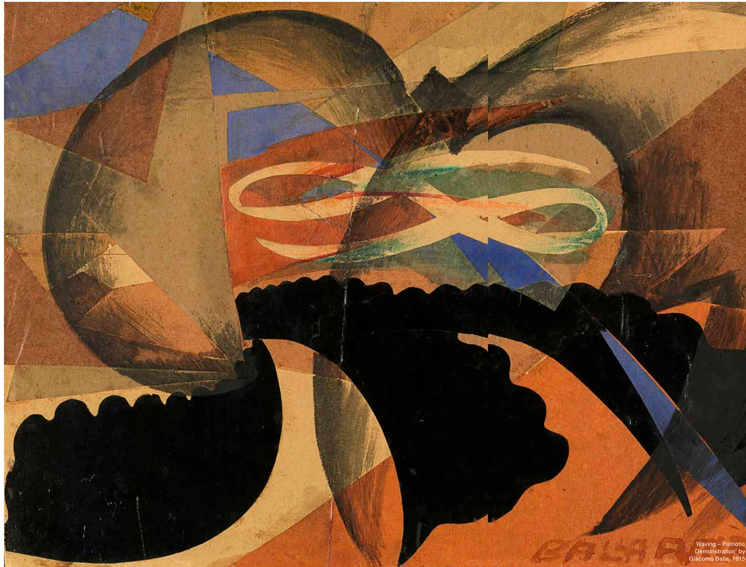
Waving - Patriotic Demonstration' by Giacomo Balla, 1915